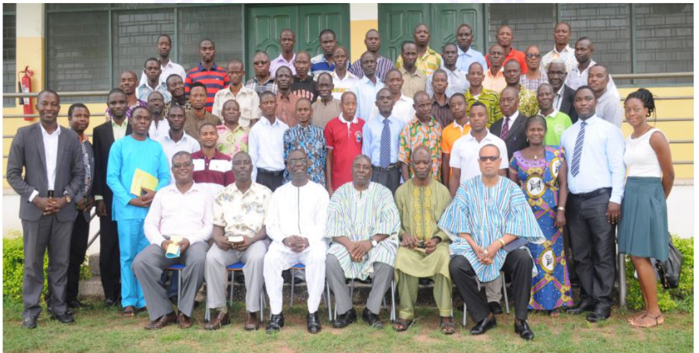
In picture are the beneficiary preachers, executives of Rescue Ghana Mission (RGM) and Heritage Christian College (HCC) after the opening ceremony to commence the Refresher Training Course- 2017

In June 2017, Rescue Ghana Mission (RGM) entered into partnership with the Heritage Christian College (HCC) to offering annual refresher training for the beneficiary preachers to retool them to be effective in their ministry. The first edition of the training program brought all the beneficiary preachers to Accra from all the regions.