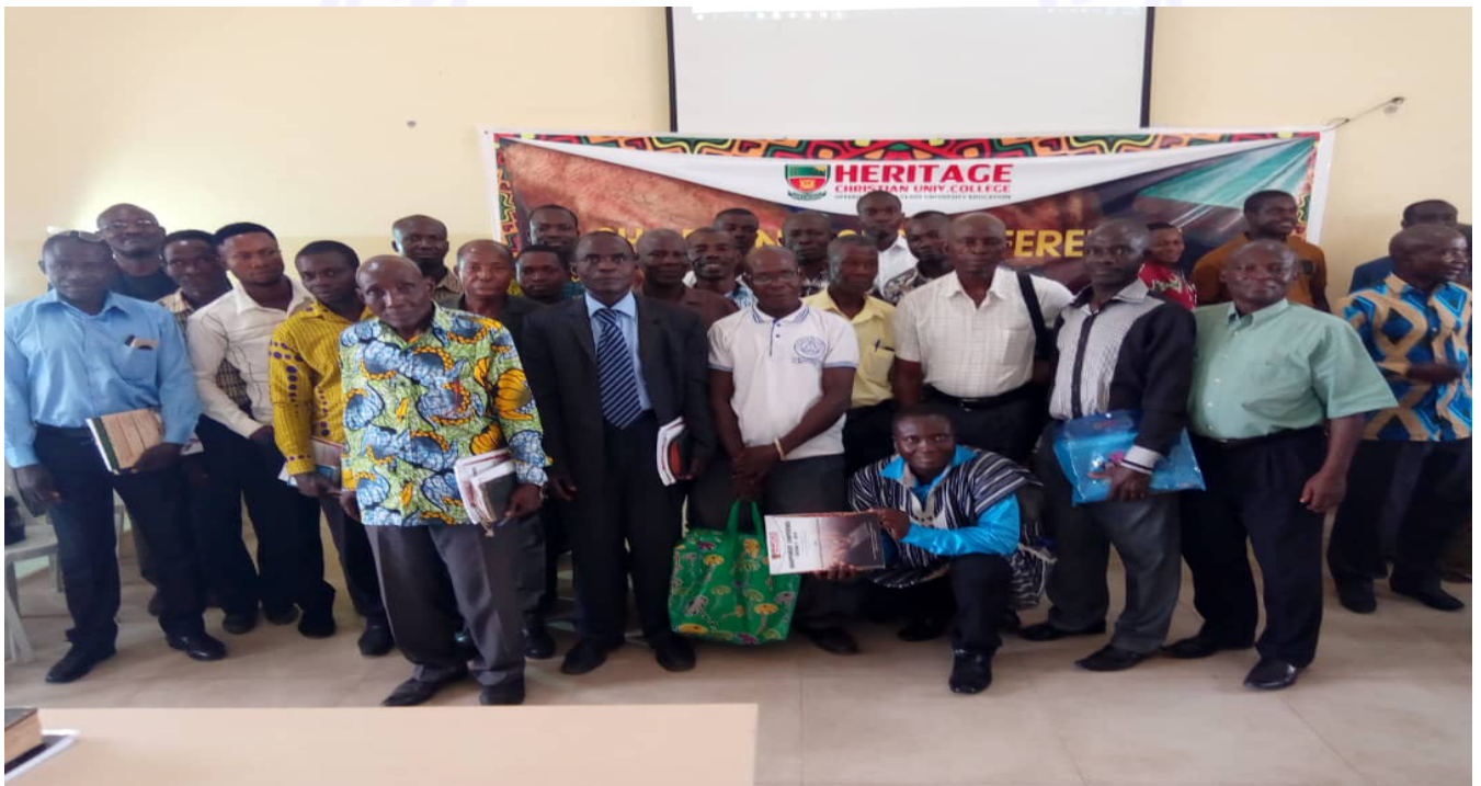
RGM Annual Cloth Donation campaign for beneficiary preachers in 2018